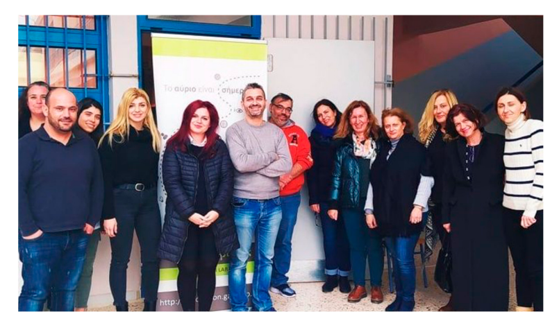
Figure 6. Primary school teachers receiving training on educational robotics together with their instructors.

To make this possible, we have extended our approach, adding training not just for pupils but also for teachers. Although in our program, we focus on educational robotics, which is narrower in scope than STEAM, we still do not feel that it should be limited to teachers with a background in computer science. Quite the contrary, we believe that given the right support, it is a subject that could be taught by almost any teacher at the level required in primary school. In Figure 6, we see one of the first groups of teachers who were trained at Innovation \Gamma AB LAB on providing the "Programming the mBot robot" course. We chose this course specifically not only because it is the most popular one but also because it is the simplest one; it requires no previous experience with educational robotics and requires the least previous experience with technology in general. The teachers included in this program all come with a pedagogical background and very limited previous experience with technology and computing.