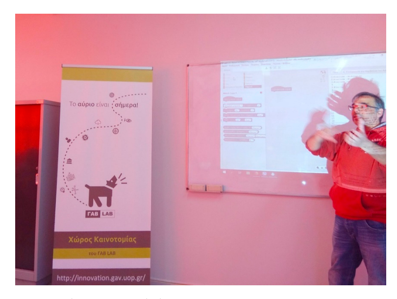
Figure 4. The innovation hub in operation.

Our group operates an innovation hub titled Innovation \Gamma AB LAB , which it uses for its activities that are designed for the community. In the hub, in order to apply what we described in the previous section, in early 2019, we established our own private robotics education school (see Figure 4) that provides free courses to any interested pupil between 9 and 16 years of age.