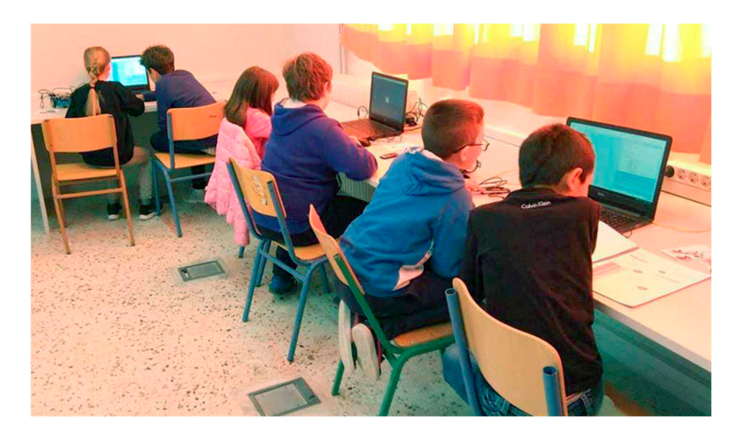
Figure 5. Pupils working in pairs on programming the mBot.

It quickly became evident that the course designed for the age group 9–12 (see Figure 5) was the most popular one, as children aged 9 and 10 (who were only eligible for that course) formed the most populous group of applicants. As a response, we updated the schedule and added more sessions of that course.